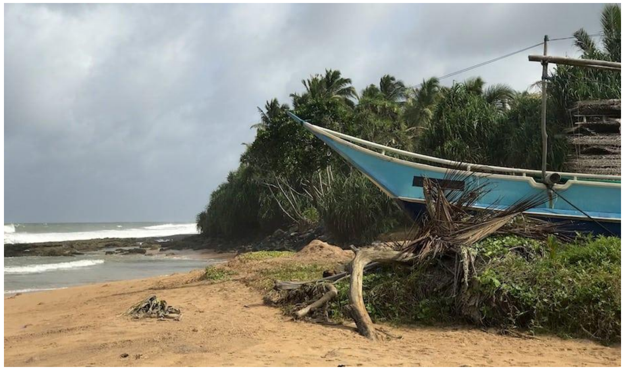
Thambapanni Beach is so close to the villa, you can hear the sea at night.

Saffron and Blue, Sri Gnanawimala Mawatha Hiddaruwa, Kosgoda, Sri Lanka