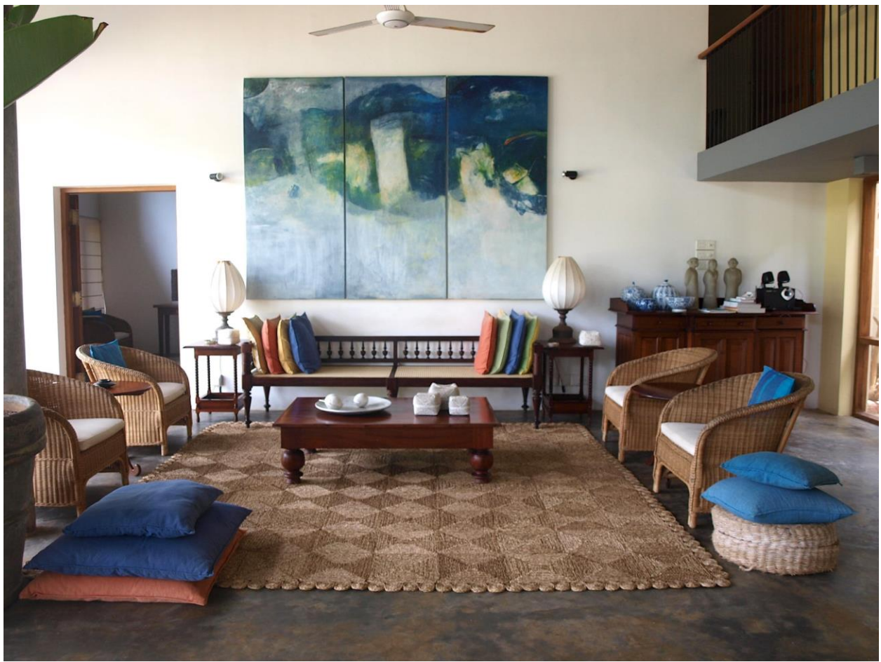
We so want to steal this style.

We need to talk about that pool for a moment. It's stunning, no? But do tear yourself away from that sun lounger, because Saffron & Blue is a moment's walk to Thambapanni Beach. And we do mean a moment: you can hear the ocean at night. Travelling with kids or sandcastle-architects? This is high-quality engineering sand. There's a turtle hatchery on the beach, too.