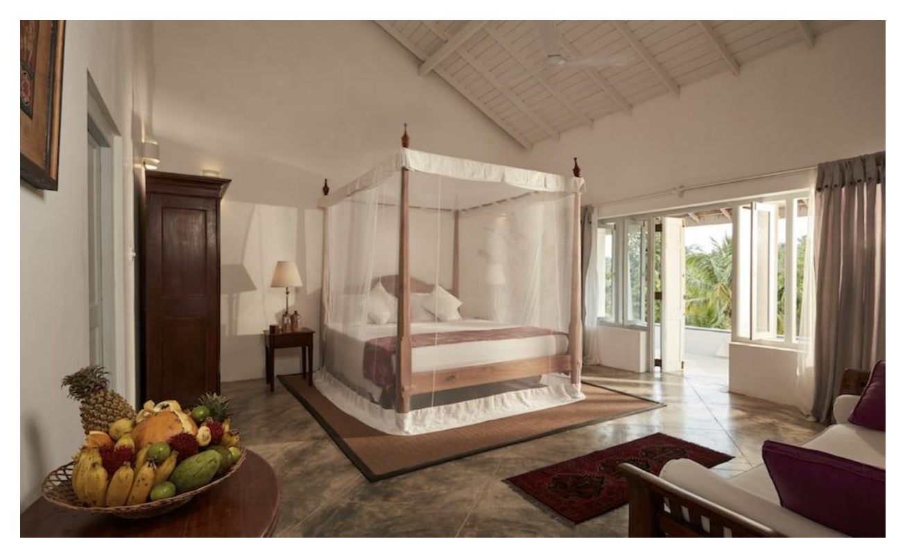
The master bedroom is in the original 100-year-old property, which has been extended to create this spectacular villa.

More indulgences: massages on the back porch and mani-pedis can be arranged by the staff. Yes, you should do it. There's an infinity pool that spills down the hillside; deck chairs for more lounging beside a wall of greenery. Bringing kids? There's a serious stash of toys and the grounds are great for games, rollicking, and gazing at papaya trees. And here's one magic moment: we witnessed the resident pea hen's eggs hatch one morning. Told you this place was special.