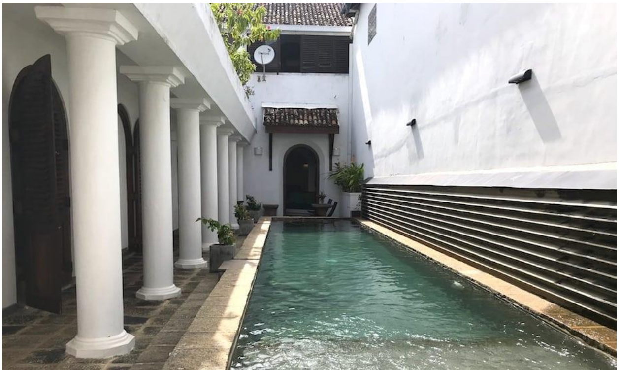
Hit the plunge pool after exploring the old town in Galle Fort.