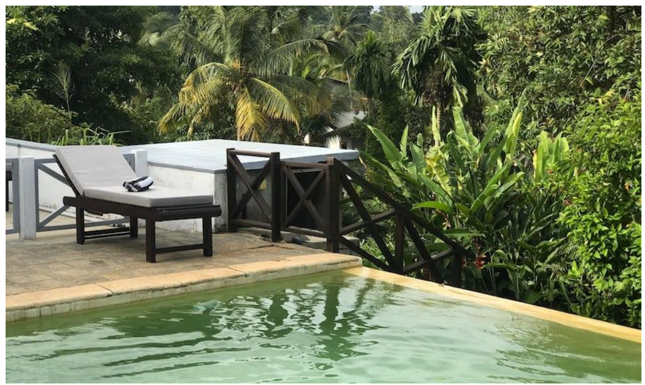
Take a dip: Pooja Kanda Villa feels gloriously secluded.

Yes it's close to Galle Fort (20-30 minutes away), but we're saving that for later. Short ride to the epic Wijaya beach. This is the one you've probably heard your friends rave about. Swing on a rope over the water, take a dip in the rock pools or chill in the seaside restaurant sipping on coconuts (but word t the wise: visit at low tide). You can also go cycling in the hinterland, scuba diving and whale watching (November to April is the season for the latter).