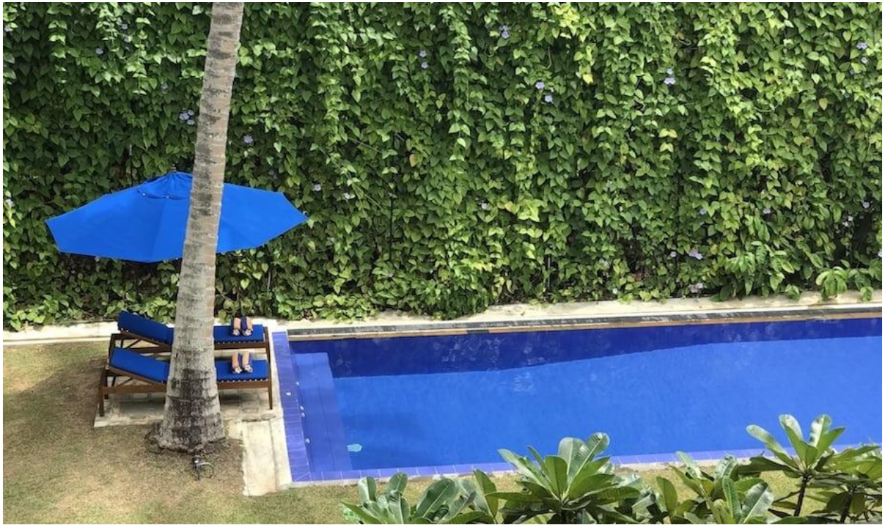
One inviting scene on a sunny day.

This place is all about beach, eat, pool, repeat. As with each of these villas, the in-house chefs can whip up all of your meals; you just need to pay for the supplies, which they'll buy fresh from the market. The local dishes here were spectacular, but truth be told, the kids' menu needs a little work.