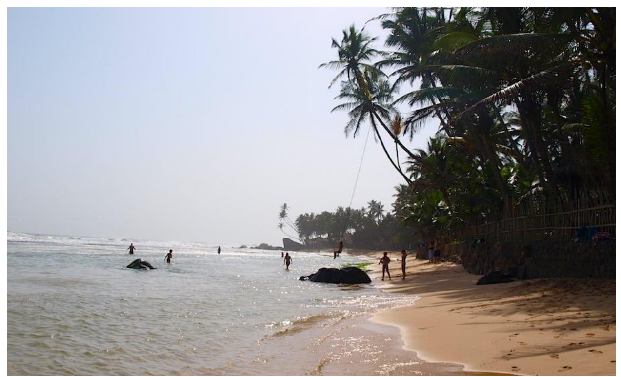
One of the world's special places is just a short drive away: Wijaya beach.

But really, it's tempting to stay in your sprawling mansion all day, every day.