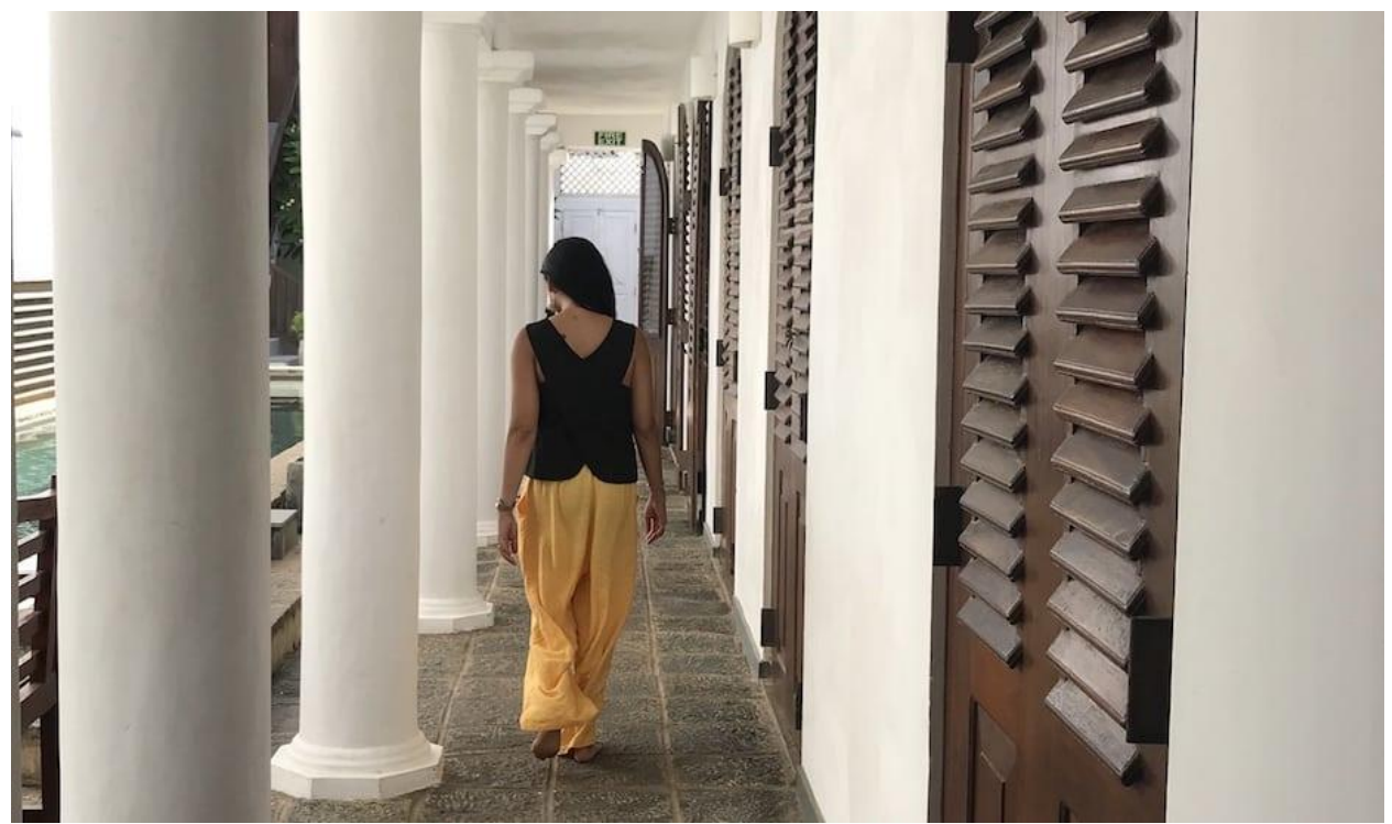
Every corner of this grand old villa is divine.

This is another five-bedroom stay (two up, three down), with a lounge area populated by the most enormous sofa I've encountered, a dining room that fits a crowd and a great little plunge pool for cooling off after exploring the fort. The decor – massive mirrors, tiny antique boxes – is evocative and authentic. There's an upstairs alfresco area you need to spend some serious time in – all whitewashed walls and sky blue cushions, this space was made for sipping Camparisodas at sunset.