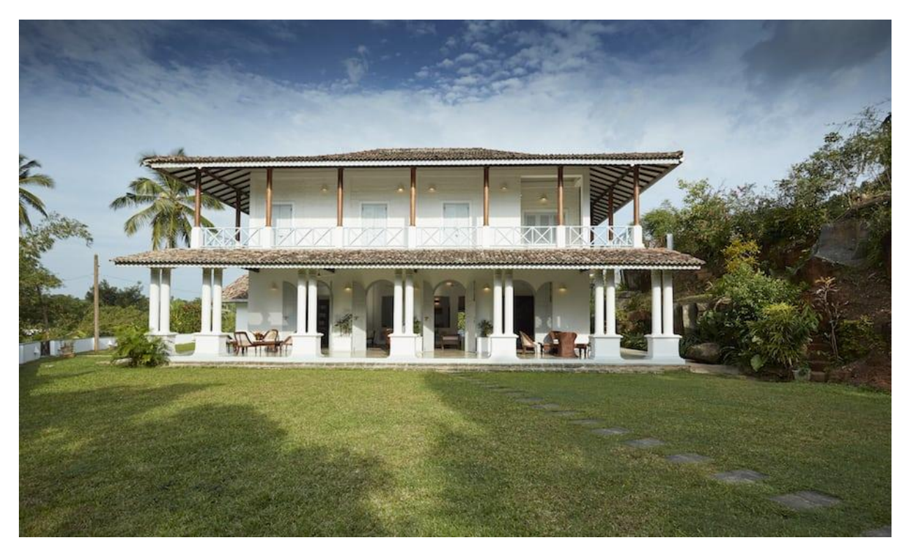
Pooja Kanda Villa is the colonial mansion fantasy stay.

Published September 12<sup>th</sup>, 2018 By Selina Altomonte