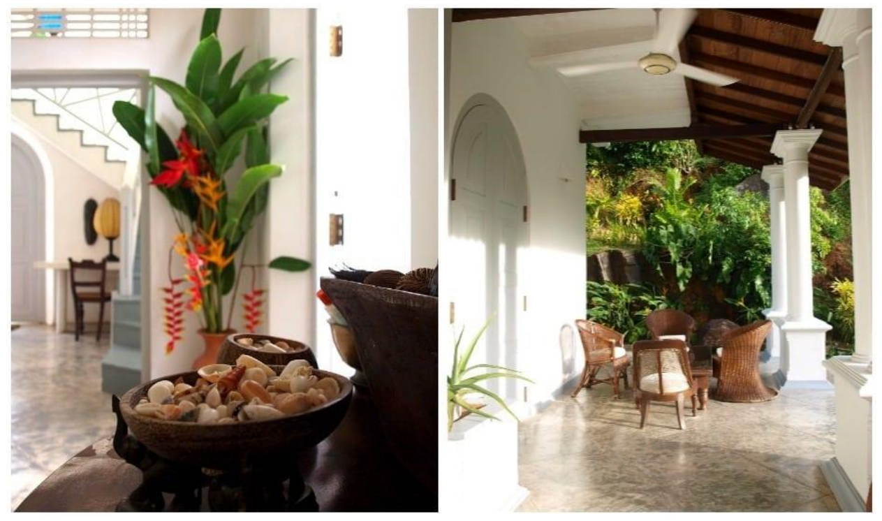
Characterful decor and corners for relaxing.