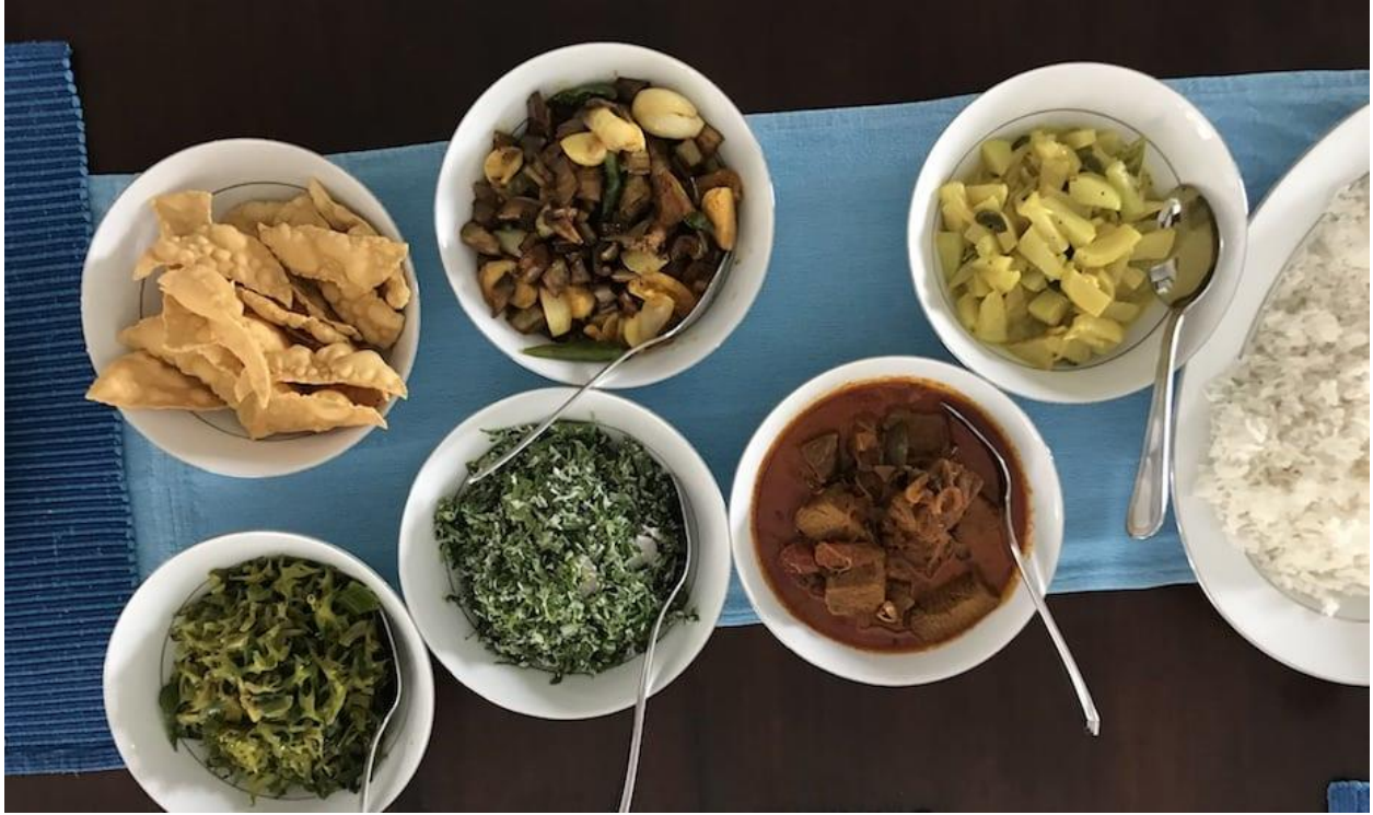
Just your average lunch at Ambassador's House, whipped up by the private chef

Now here's a tricky situation for you: the food being whipped up in your villa is divine, but you've spotted so many gorgeous restaurants a short stroll away. Our strategy? String hoppers for breakfast and all the amazing curries at home for lunch; dinners out. Heads up: there's a trend in town for modern Middle-Eastern menus... but we didn't come all this way for anything other than Sri Lankan. DO head over to Church Street Social for a memorable meal, and to ogle Galle Fort Hotel.