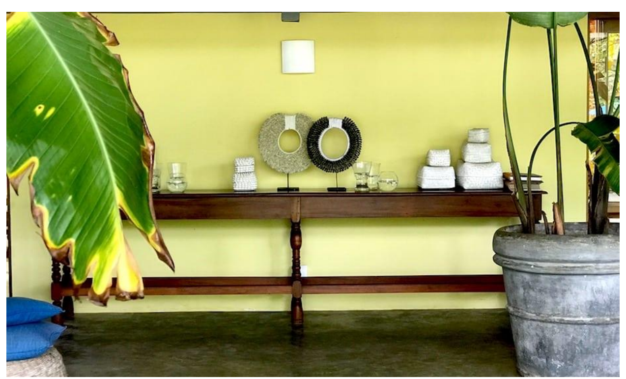
Saffron & Blue villa is one for architect and interior decor lovers.

And finally: the beach stay, and one for architecture and interior decor obsessives. The most modern of the three villas, the aesthetic and atmosphere here provide a cool contrast to Villa Pooja Kanda and Ambassador's House. A striking exercise in modern concrete, this place is all about texture, bold colour and proportion. There are four bedrooms here (one downstairs, three upstairs). The Emerald and the Gold rooms have outdoor jacuzzis. Nice.