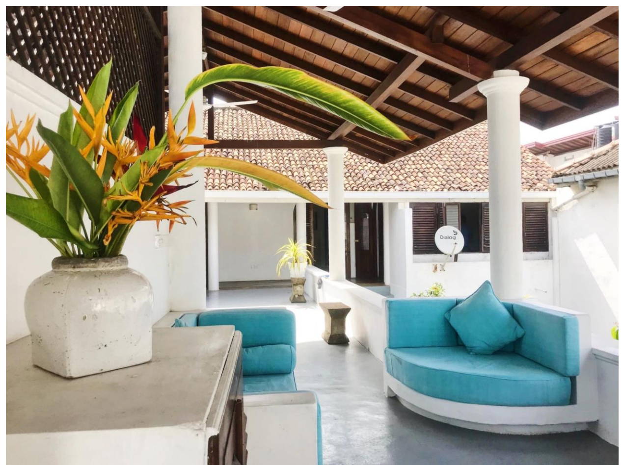
We think we've just found the perfect spot for a sundowner.

What do we love about Galle Fort? The people, for one, are so chill. No pushiness here. It's ridiculously easy to navigate: we tried to get lost, and all roads seem to lead back to Lighthouse Street... and this villa. Hit the lighthouse first – it IS at the end of the street, after all, have a drink with a view at the Old Dutch Hospital, and walk the walls of the Fort. It's amazing.