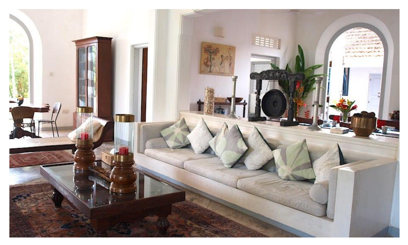
Pooja Kanda Villa was made for spreading out.

It's a five-bedroom villa (three up, two down), built around a 100-year-old property with a helluva lot of character, from the collected seashells and books, to the daybeds aplenty. It feels like a place built for lounging, dining, and more lounging. The front porch is made for sitting back and sipping tea and reading books all day, balconies for taking in that view.