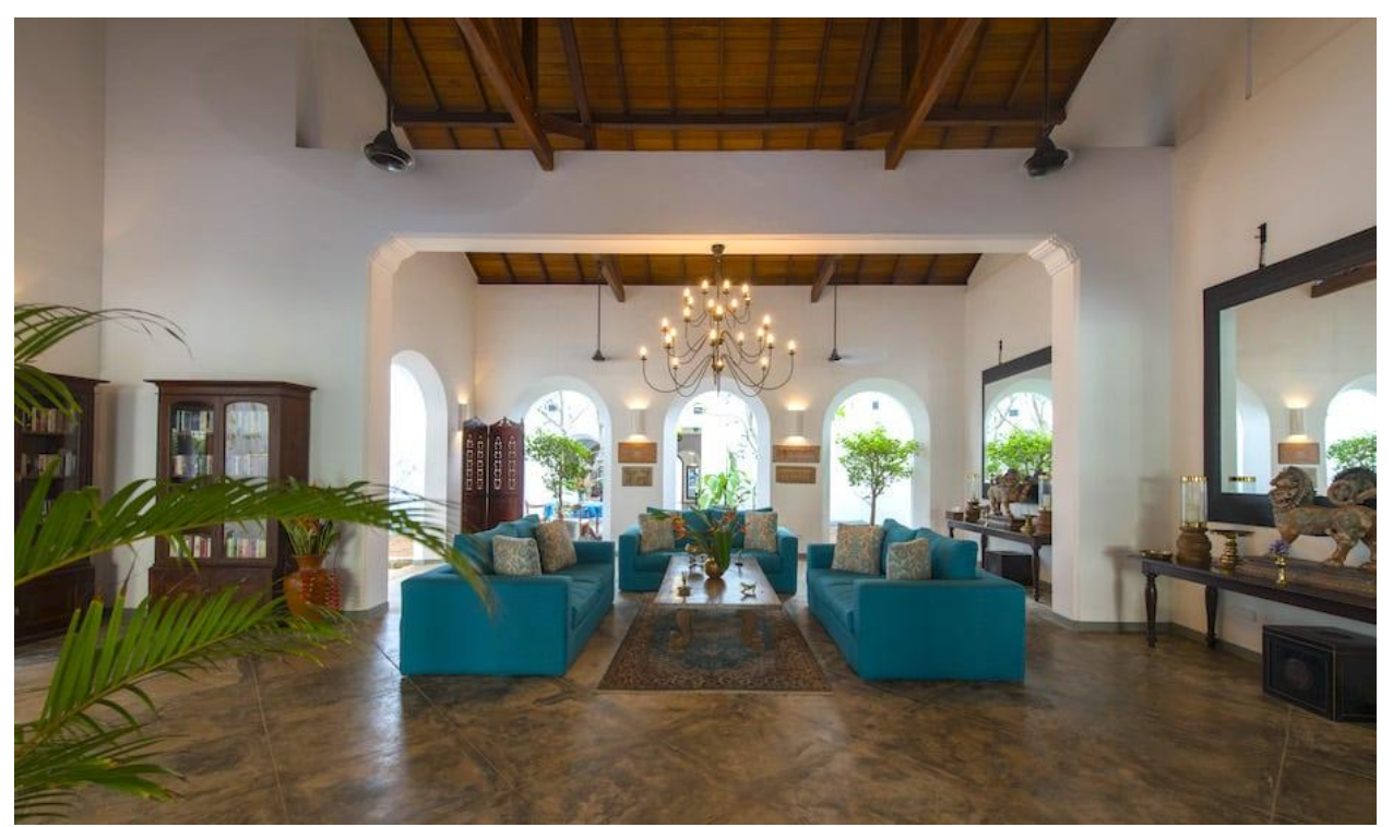
The next-level living room at Ambassador's House, right in the heart of Galle Fort.

On to Galle Fort and The Ambassador's House on Lighthouse Street: a swoonworthy stay in a heritage property (we're talking 17th century) that was a favourite of the Sri Lankan Ambassador to Pakistan, Iraq and Bangladesh. There's more history than you can poke a stick at right here, and it's not just history on your doorstep – the doorstep itself is historic. It's extraordinary to have so much lounging, sunning and sundowner space, right in the heart of the old town. (Consider it the ultimate indulgence to be in a villa where one can't even hear one's child tantruming at the other side.)