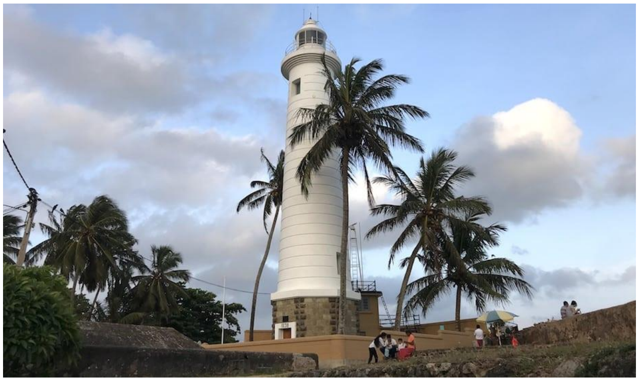
So this is literally down the road from your villa.

And if you've been itching to go shopping since you landed in Sri Lanka, this is your moment. From beautiful textiles at Barefoot, to unique homewares, jewellery and enormous raw gemstones, this town is made for walking... and shopping.