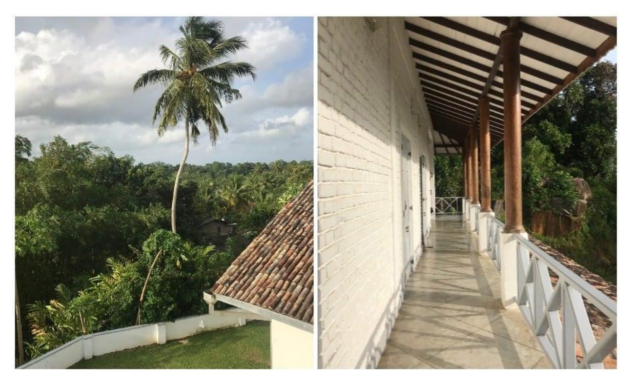
That wraparound balcony delivers the views.

For a colonial mansion with sweeping views from a hilltop