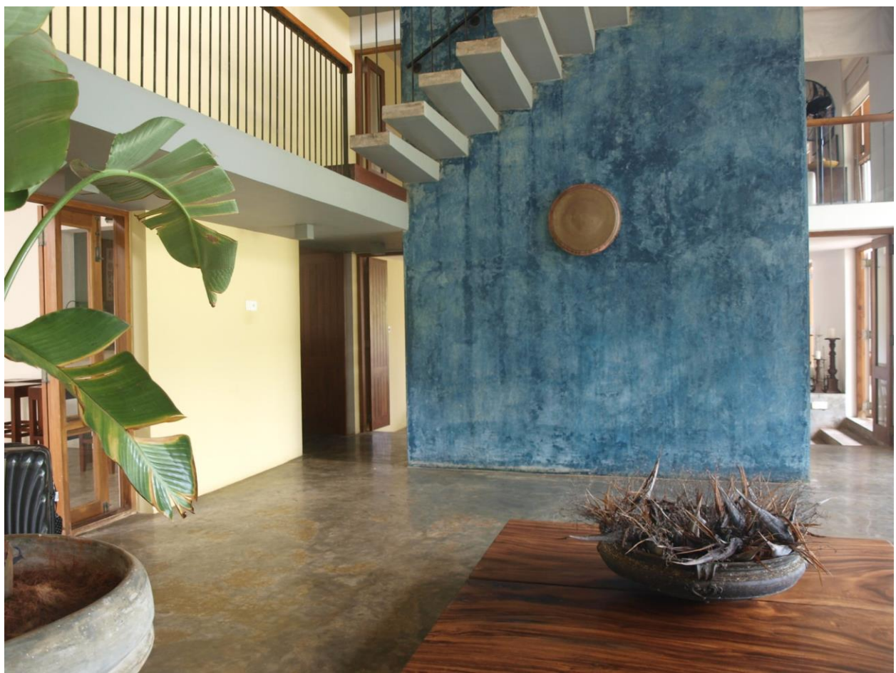
Concrete doesn't get any cooler than this.

There's a sunken dining room with an enormous table that doesn't exactly encourage intimacy, but there's an intriguing mass of candles that brings on the mood at night. And the lounge area? We want to haul the whole scene back to Singapore: the shell necklaces, the wooden mangoes, that enormous jute rug, the massive pots with tropical leaves. You think they'd notice?